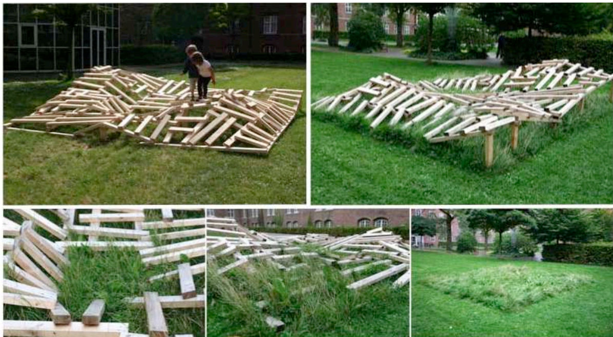
Dobbelt Landskab - en have 2008

Dobbelt Landskab - en have (Double Landscape - a garden) (2008) (fig. 10) is another example of one of her site-specific installations.