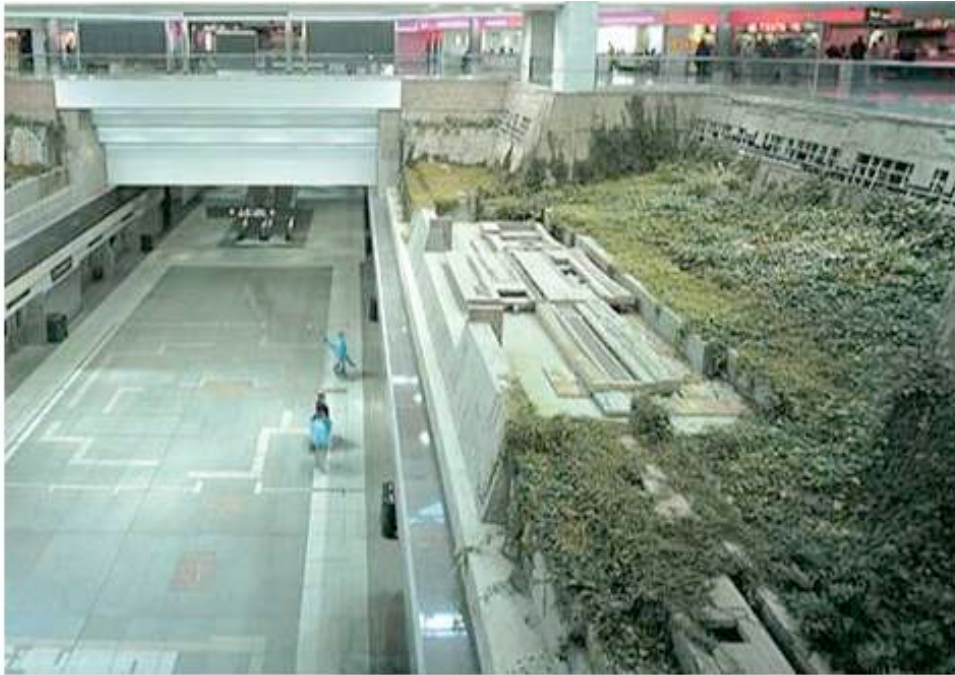
For example, Solid Waste Transfer and Recycling Center (1989-1993) , Phoenix, Arizona is transformed into an enthralling and fully functional facility. 5