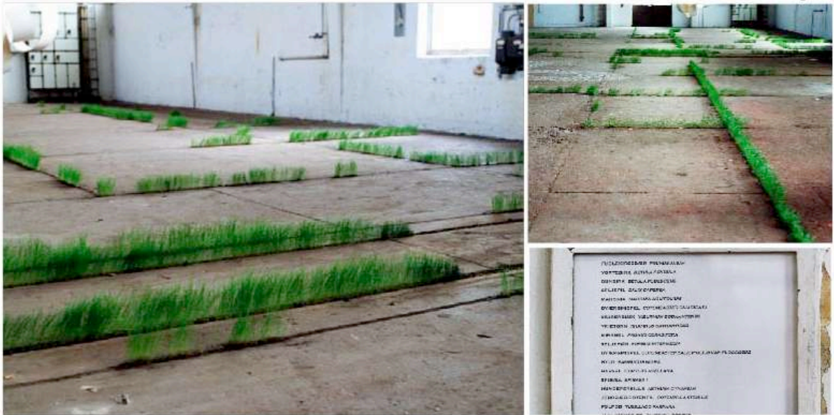
Pavement and Parliament 2003

materials she has used are soil and Italian ryegrass. The work was displayed in the exhibition entitled "Other rooms", FLS hall 9, Valby.