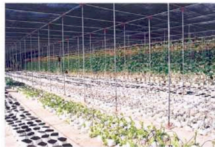
Images from the vegetable farm in the Maldives, which employed and trained 15 people from 2002-04 by Soren Dahlgaard.

The island Hibalhidhoo is 36 acres. The shadehouse is 13 ft tall and 2500 m2. Lettuce and cucumber plants inside the shade house. Bottom right: The irrigation system for the plants.